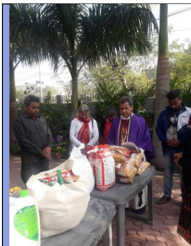
Hand Full of Rice WFCS