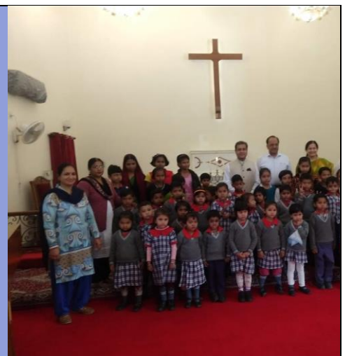
Outreach Project Children