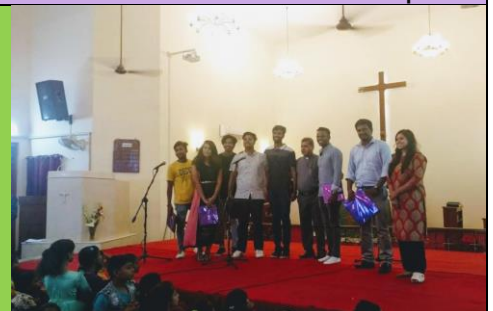
VBS Praise & Worship Team