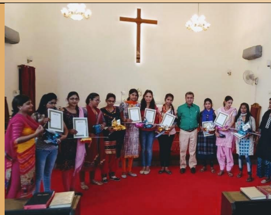
Certificate Distribution -Tailoring