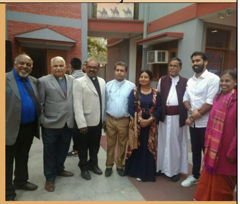
Annual Fete - with Bishop