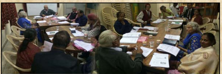
60 Minutes in the Chair