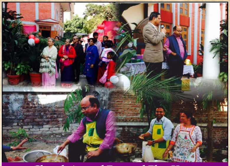
Church Annual Fete and Ekta Utsav