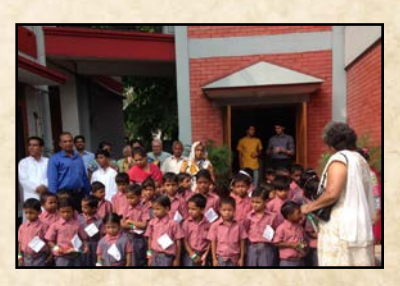
Entrepreneur Development Project - Tailoring Program